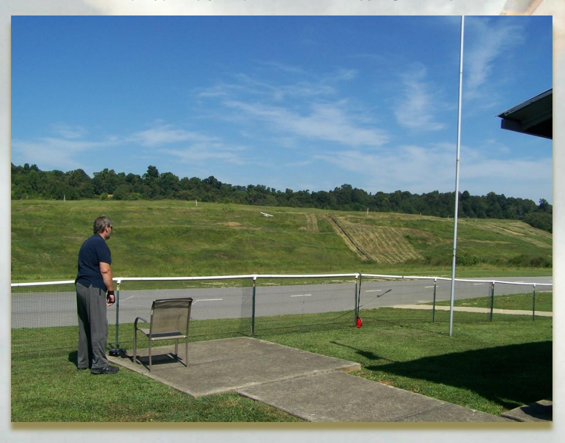
Time for a last look at the runway and a last trip towards the hill!!