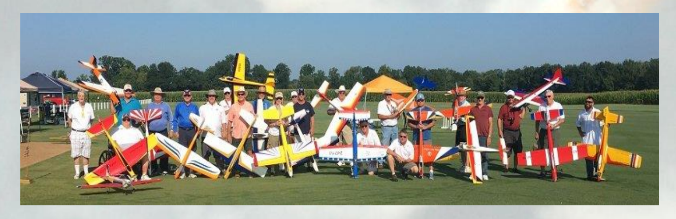
Can you find our Champs in this gaggle??