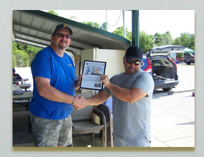
When you fly like this.....You get the award for THE BESTEST LANDING!!!