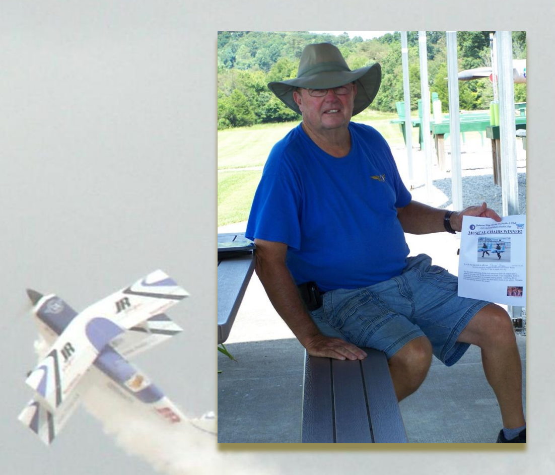
And, when you fly really good, you take home a lot of first place certificates!!!