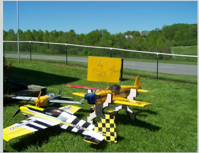
and planes for sale.....