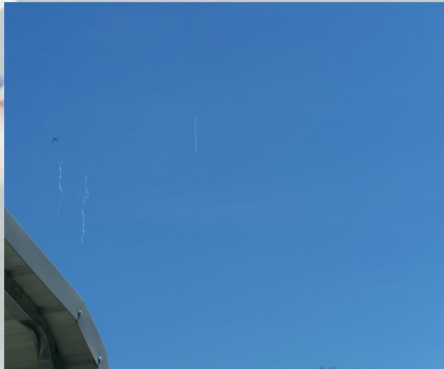
and their pilots