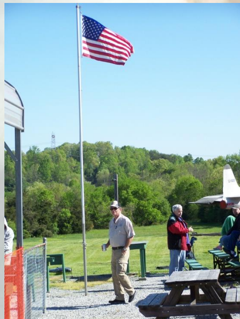
and just plain dawdlers