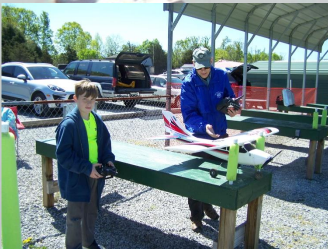
Young flyers to be.....