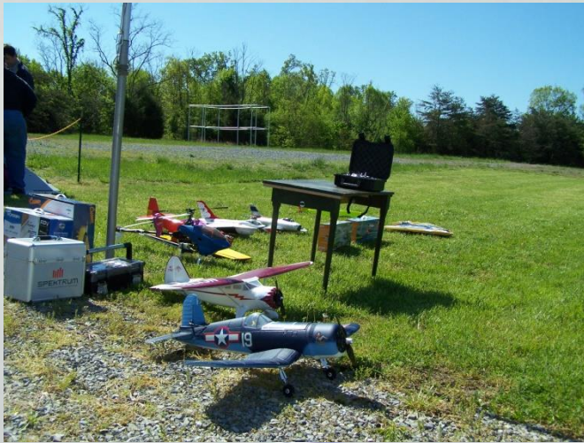
There were planes on display...