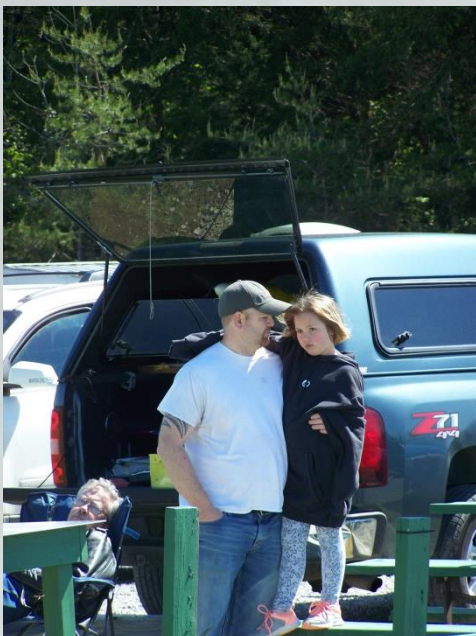
Daddies and daughters