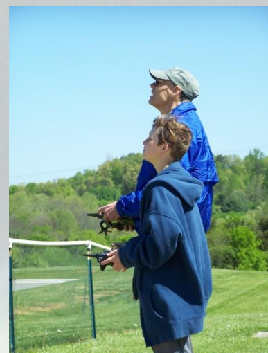
and now, young flyers...