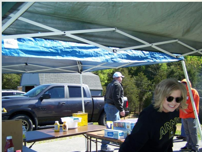
And, of course, the only reason to eat at Tim's cafe