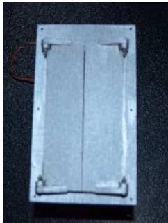
View with the doors closed.

Assembled the bombay is 4" x 4" x 2 3/4"