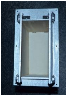
View with the doors open. There is plenty of room to make a decent candy drop.