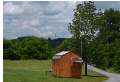
Wind and solar power in place