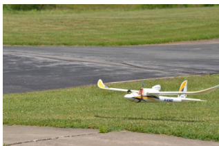
The Bixler returns home.