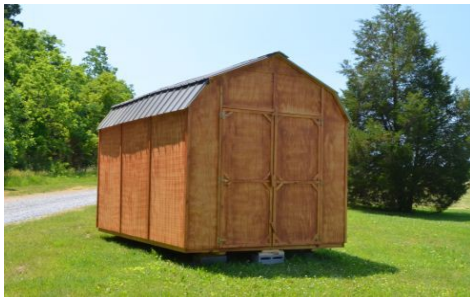
A new building and charge stations at the lower area