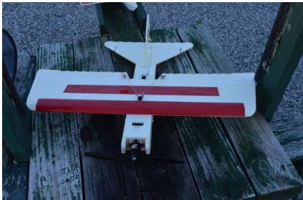
Ed McEntire's Bloody Baron

Below is the plane most are using at the field. It is called the Bloody Baron and a kit may be bought at http://flitetest.com/ . It is foam and easy to repair (a good characteristic for a combat plane).